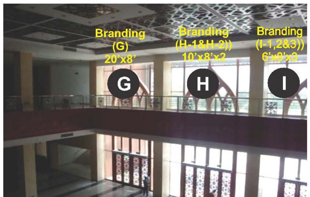
Reserved for Diamond (G), Gold-1&2 (H-1,2) & Silver-1,2&3 (I,1,2&3)