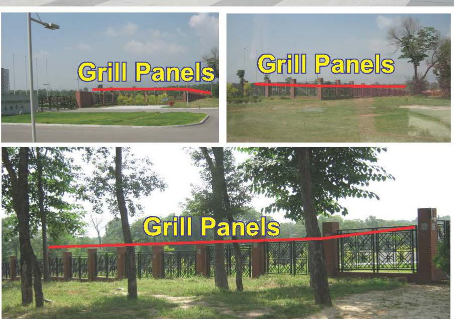
Reserved for Sponsors