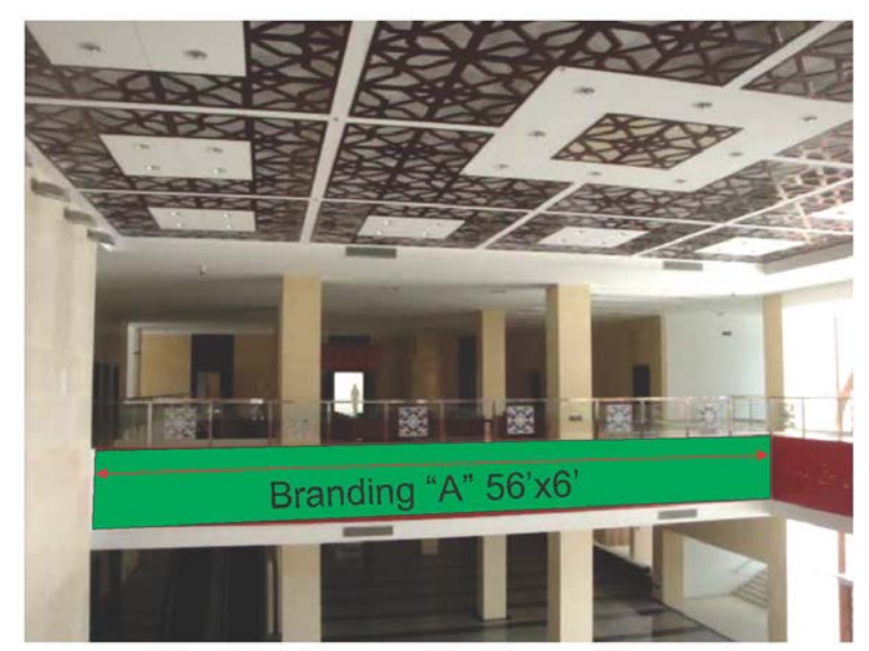
Price PKR: (Reserved for Diamond Sponsor)